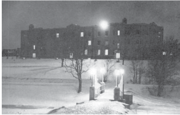
from 1948 Phillipian