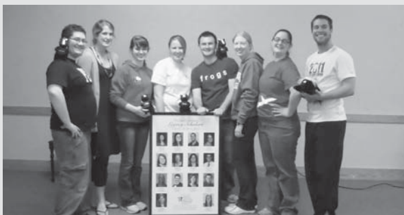
2012 Phillips Legacy Senior Class